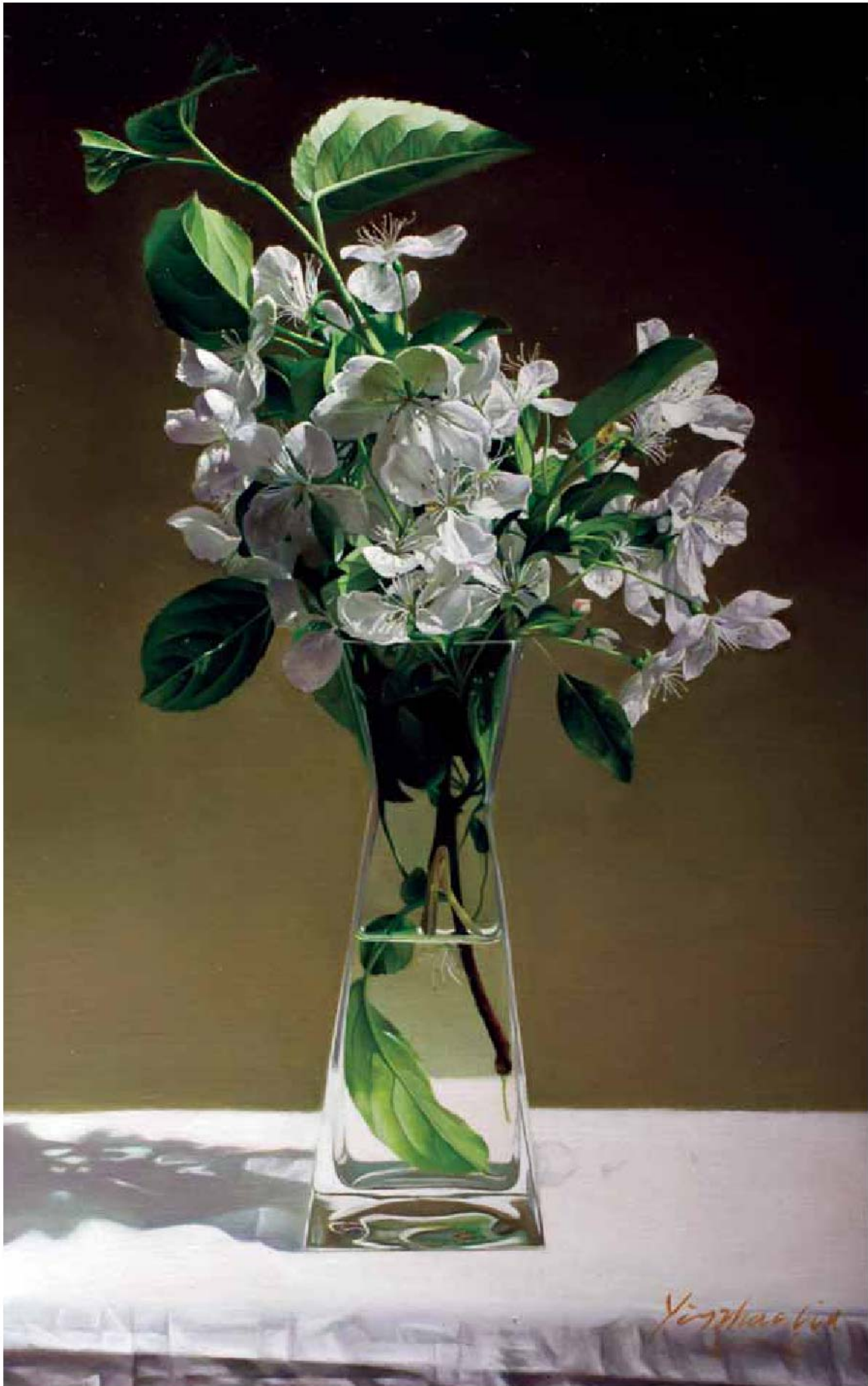
YINGZHAO LIU, WHITE FLOWERS IN GLASS VASE, OIL ON CANVAS, 22 X 14"