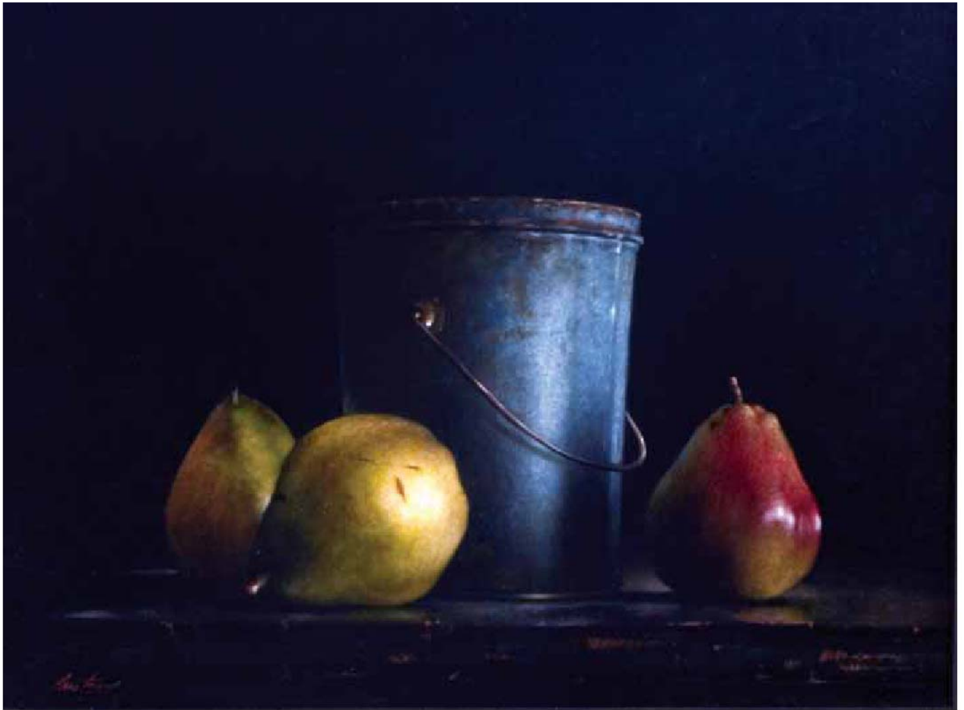
LARRY PRESTON, PEARS WITH BLUE PAIL, OIL ON CANVAS, 14 X 18"