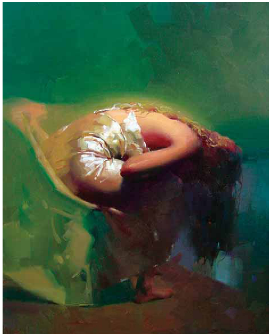
ZHAOMING WU, OVOIL, OIL ON CANVAS, 20 X 16"