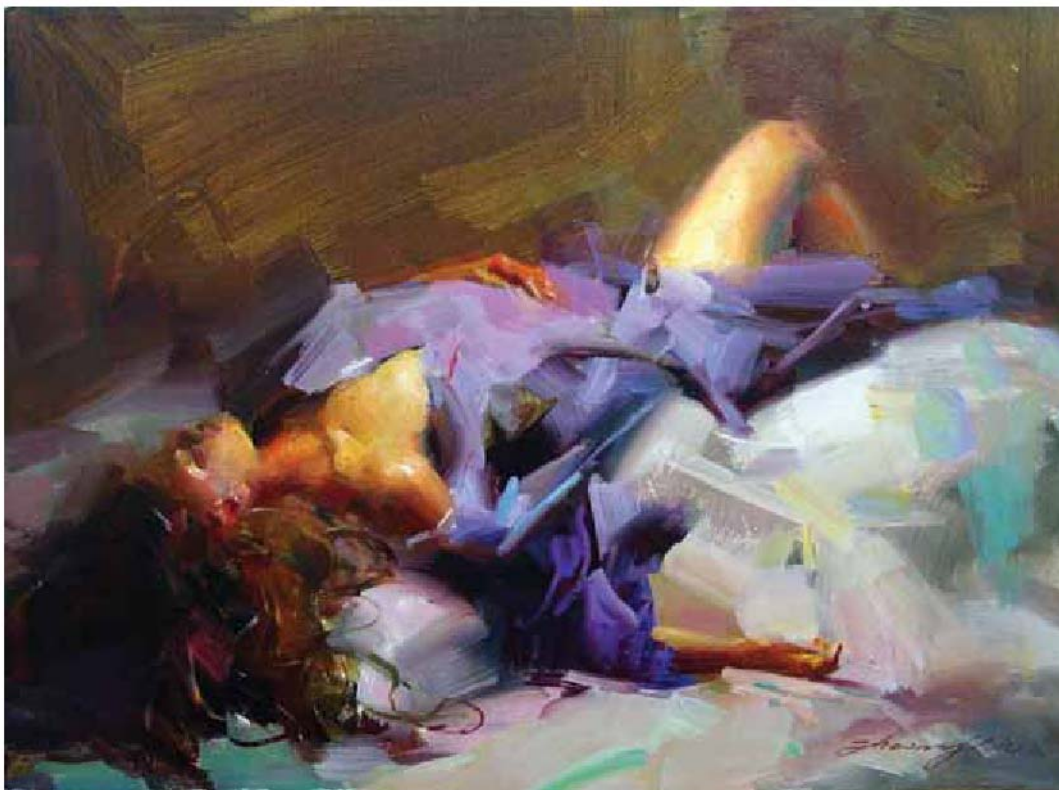
ZHAOMING WU, THE NIGHT OF THE PURPLE, OIL ON CANVAS, 12 X 16"